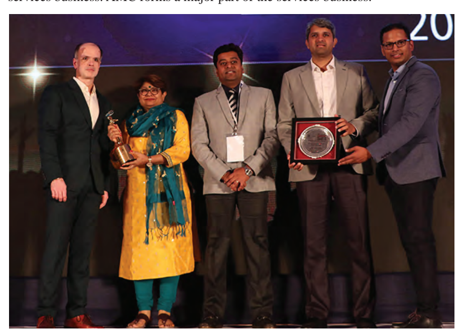
Eureka Forbes was awarded with the "Best Customer Experience" Transformation" title at the Customer Fest Awards 2020

Strongly known for its product offerings, Eureka Forbes is now known for its services business. AMC forms a major part of the services business.